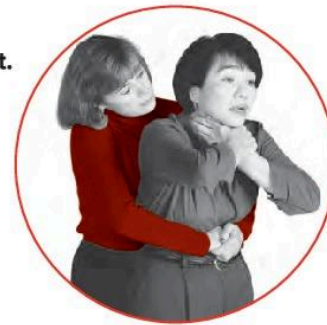
between the navel and lower end of breast bone

Provide quick, upward and inward abdominal thrusts (Heimlich maneuver) until the food or object is forced out.