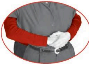
hold it with the other hand against the person's abdomen