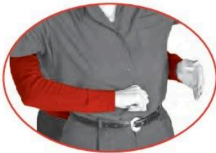
Make a fist with one hand

Ask, "Are you choking?" If the person gestures yes, stand behind the person, wrapping your arms around the person's waist.